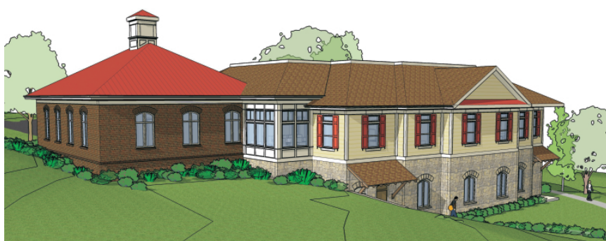
New facility for our Family Medical Center in Angels Camp is planned for completion in 2011.

The involvement of our community partners has spring boarded us into the future, and it is bright for our communities we serve.