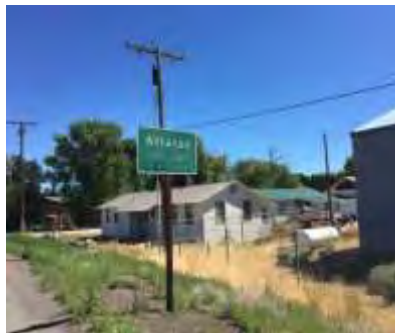
Last Frontier Healthcare District (Alturas)