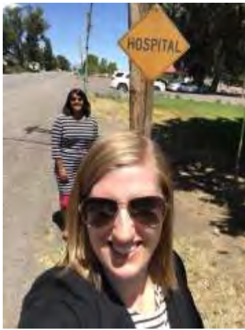
Surprise Valley Healthcare District (Cedarville)