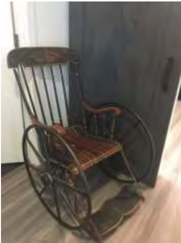
Antique wheelchair, Tehachapi Valley Healthcare District (Tehachapi)