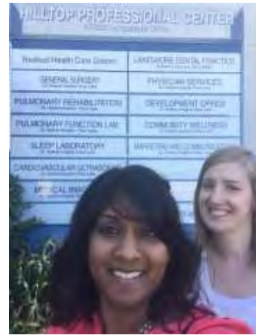
Redbud Healthcare District (Clearlake)