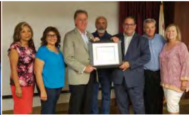
Pioneers Memorial Healthcare District