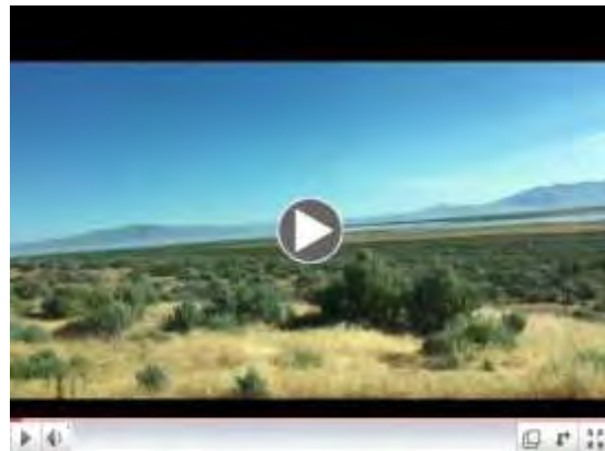
Views From the Road!