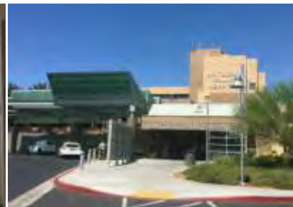
Antelope Valley Healthcare District (Lancaster)