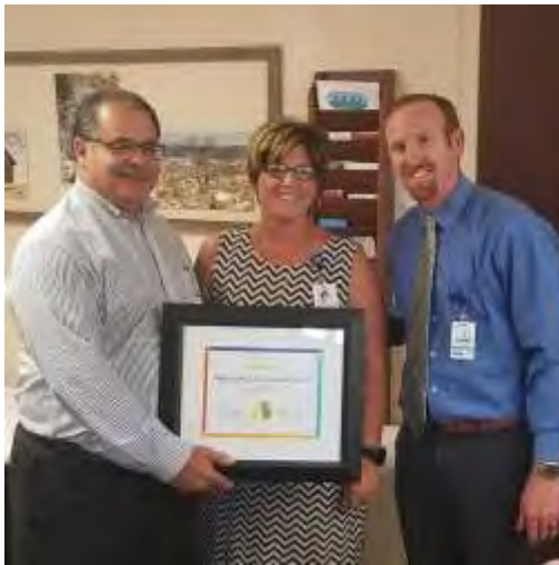
Mayers Memorial Hospital District