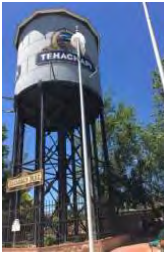
Tehachapi Valley Healthcare District (Tehachapi)