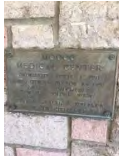
Last Frontier Healthcare District (Alturas)