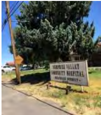
Surprise Valley Healthcare District (Cedarville)