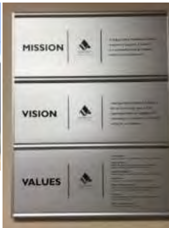
Antelope Valley Healthcare District (Lancaster)